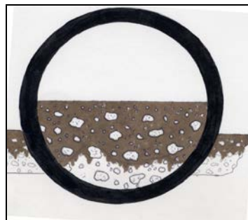
Treated with Trojan Ultra