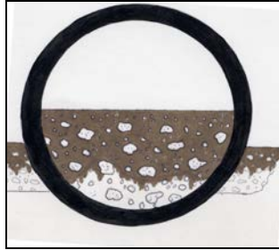
Treated with Trojan